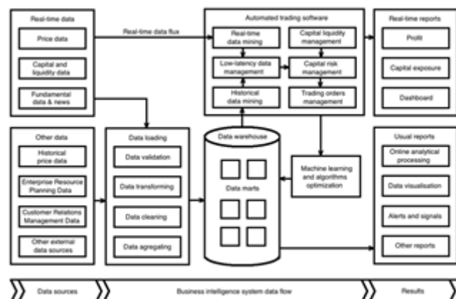
Fig.2.Methodology workflow of the Real-Time Business

This module presents analytical results through interactive dashboards, charts, and automated reports. It helps managers easily understand complex business insights and supports real-time monitoring of key performance indicators.