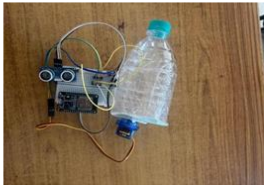
Figure 5: Output image

The output interface of the proposed IoT-Based Automatic Fish Feeder system provides real-time feedback and monitoring of the feeding process. It displays the feeding status by processing user inputs such as fish count and executing controlled food dispensing through the servo motor. The system ensures that the appropriate quantity of feed is delivered and confirms the operation through live video streaming, allowing users to visually verify the feeding activity. Additionally, the interface presents status updates such as feeding completion, execution success, or error alerts in case of communication or hardware issues, thereby improving system transparency and reliability.