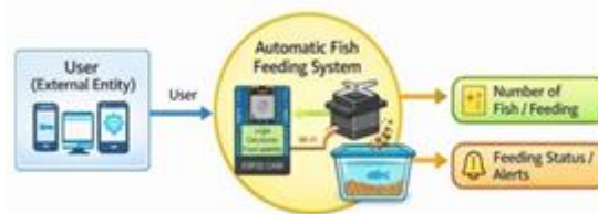
Figure 2: Data Flow Diagram Level 0

The layered architecture ensures scalability and reliability of the system. The use of Wi-Fi communication and modular design allows the system to be extended with additional features such as automated scheduling, sensor-based feeding (e.g., water quality or fish activity), and cloud data storage. The system is designed to operate efficiently with minimal latency, ensuring timely feeding operations. Furthermore, the use of low-cost components makes the system economically viable for both small-scale and large scale aquarium setups.