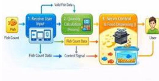
Figure 3: Data Flow Diagram Level 1

The implementation integrates user input, data validation, processing, and hardware actuation into a unified system. The Level1 data flow illustrates the high-level process from receiving user input to executing feeding, while the Level 2 diagram provides a detailed view of the internal actuation mechanism. The structured flow ensures efficient operation, real-time responsiveness, and accurate feeding control.